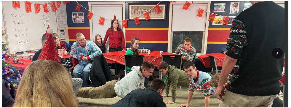
Cadets participated in "Feats of Strength" in order to gain certain advantages during the Gingerbread House contest!

Marines are proud to proclaim, "Once a Marine, always a Marine."