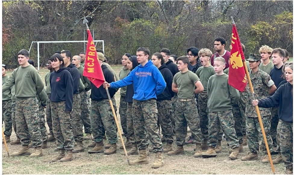
The Cadets participated in the Devil Dog Challenge in November at Salem high school in Massachusetts. The annual event brings regional schools together to build teamwork, physical fitness, and a competitive spirit!

Physical fitness can help cadets build camaraderie and teamwork with their fellow cadets.