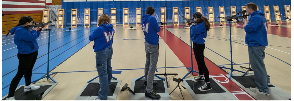
Cadets aim in on their targets in the standing position.

The Winnacunnet Warriors placed 2nd at the "Frozen Solid Seven" Marksmanship Tournament at Revere High School. It was a fierce contest between New England Region JROTC Units from the Marine Corps, Army, and Air Force. They truly did great, showcasing exceptional skill and determination throughout the event!