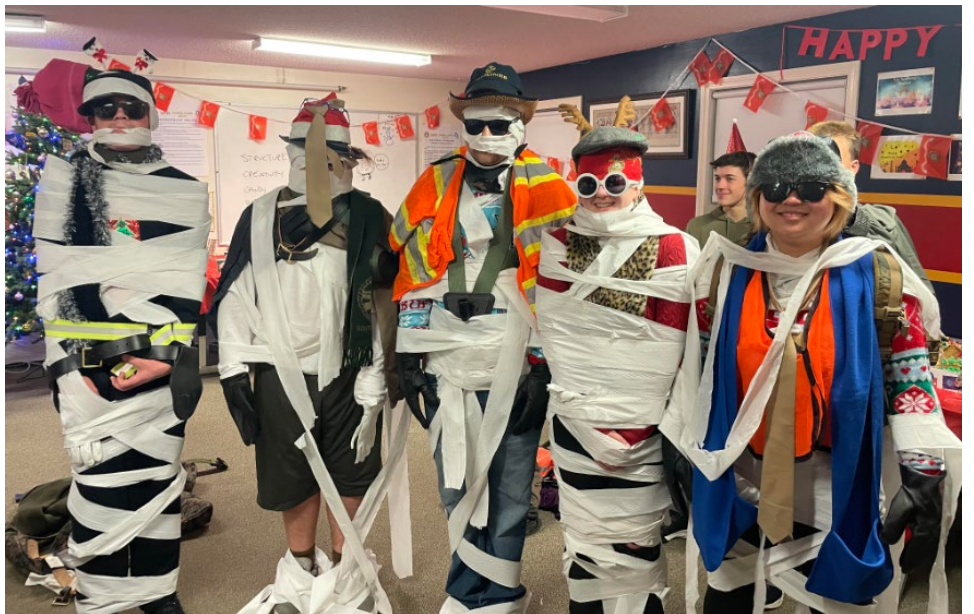
Do you want to build a Snowman? The contest tested teamwork under pressure by decorating temates with toilet paper/props in limited time.