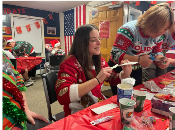
The Cadets had a time limit creating gingerbread houses using teamwork, engineering, and creativity.