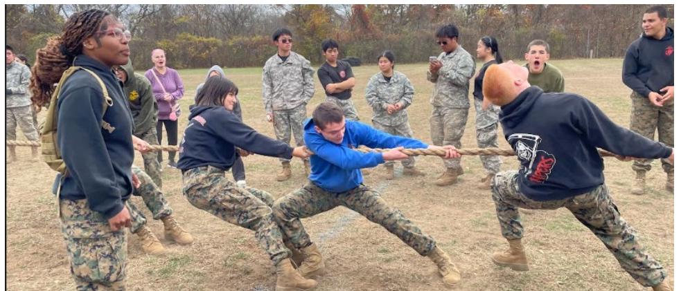
120 motivated cadets from JROTC programs across New England swarmed the lower field at Salem High School on 2 November 2025.